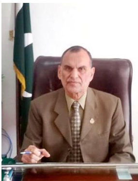
Mr. Azam Swati

(ucanews.com/news/Pakistan-minister-calls)