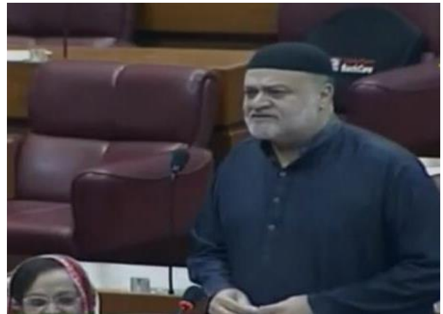
MNA Imran Ahmad Shah from Sahiwal, addressing the chair during a session of National Assembly

On this issue (murder of the presumed Ahmadi) what happened in the National Assembly on 12 August, 2020 merits special mention, even if briefly. Syed Imran Ahmad